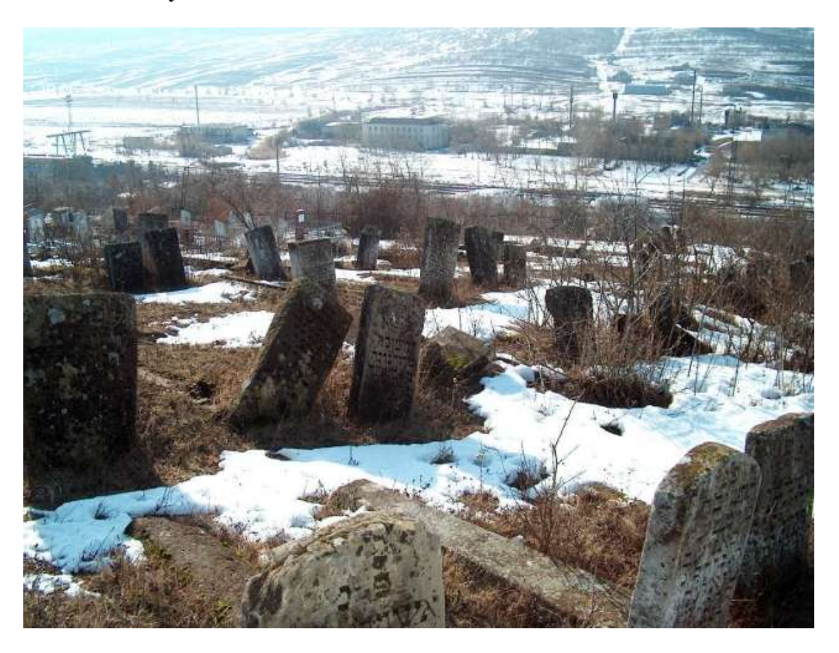
Jewish Cemetery / Holocaust Monument

The Jewish cemetery is about 60,000 square meters, and is surrounded by a broken fence. It contains over 500 gravestones, almost half of which are toppled or broken. The oldest stones date from the 19<sup>th</sup> century. There is a monument to the Holocaust victims, which was recently restored with private funds. The cemetery is still in use, but receives little maintenance. It is occasionally cleared by local residents, but overgrowth is a constant problem. The site is also in a landslide zone, where there is constant erosion and the threat of earth slides.