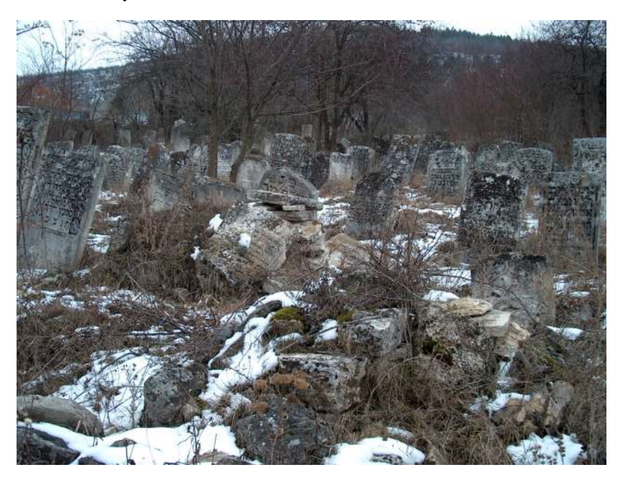
The 20,000 square meter cemetery is surrounded by a ruined stone wall. The cemetery contains more than 5,000 extant gravestones that date from the 18^{th} to the 20^{th} centuries. The site is now deserted and overgrown and more than half of the stones are toppled or broken.