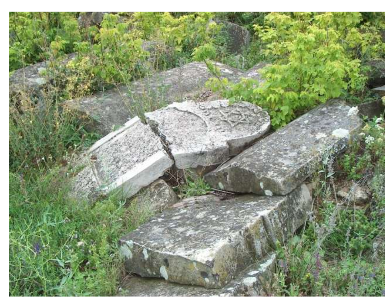
The 5,000 square meter area of the Jewish cemetery in Markuleshti is surrounded by a broken masonry wall. The cemetery contains more than 1,500 stones which date from the 18<sup>th</sup> century. The site has been neglected, however, and more than 75% of the stones are broken or toppled. The cemetery is rarely visited and there is no regular caretaker. The area is overgrown and the site has had some vandalism in recent years.