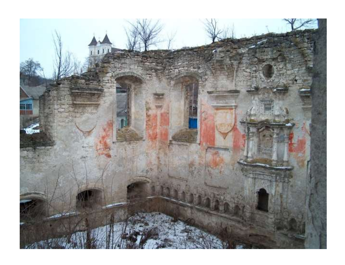
United States Commission for the Preservation of America's Heritage Abroad